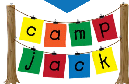
The Jack Rua Camp for Children with Diabetes