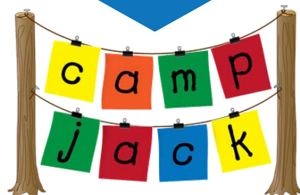
The Jack Rua Camp for Children with Diabetes